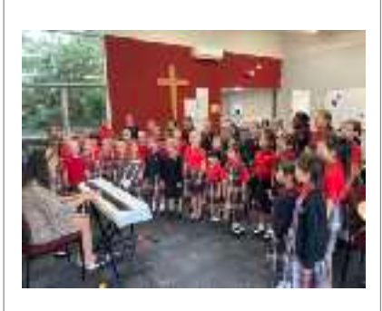
Our school choir performing to an ESOL verification visitor in March