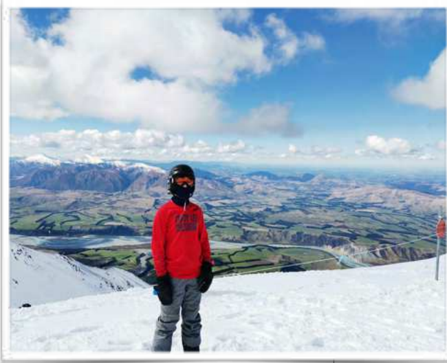
View from Mount Hutt Middle School Ski Trip

make personal decisions based on misinformation is a terrible thing. I leave it to each family to consider their own stance on vaccinations. My plea is to make well informed decisions using excellent information and to seek medical advice when needed. Some helpful sources of information could include the following: